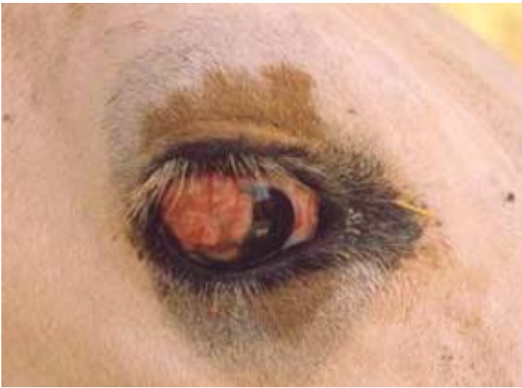
Cataract in a dog