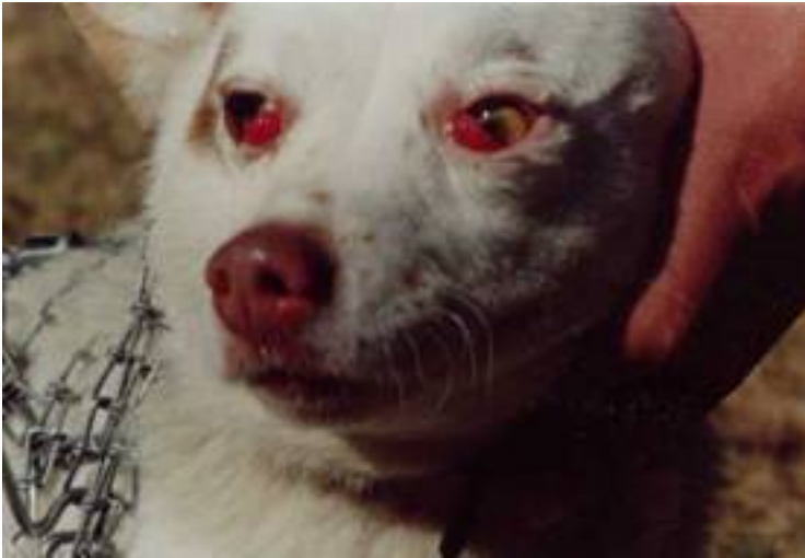
Traumatic proptosis of the eyeball of a dog nictitating membrane of a dog